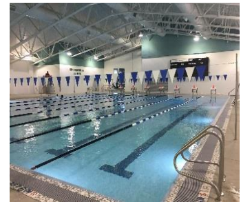
Swimming Pool-Aquatic Center

Goal Setting Session March 1, 2019 at 9 AM Approved Proposed Goal Report March 4, 2019 at 6 PM Public Hearing and Adoption of Goals March 18, 2019 at 6 PM