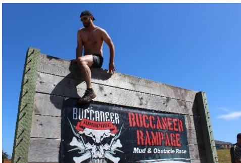
Buccaneer Rampage 2018