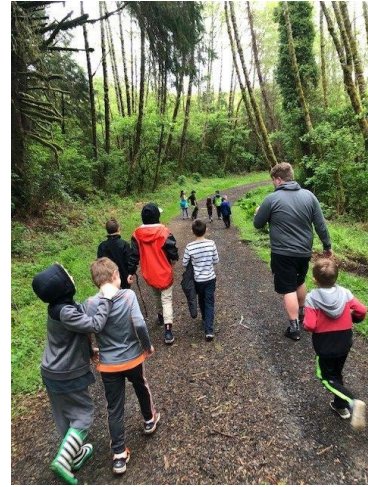
Hike on the Ocean to Bay Trail

Goal Setting Session March 1, 2019 at 9 AM Approved Proposed Goal Report March 4, 2019 at 6 PM Public Hearing and Adoption of Goals March 18, 2019 at 6 PM