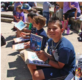
Newport Public Library Summer Reading Project

Newport Urban Renewal Agency (A Component Unit of the City of Newport)