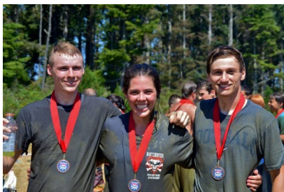
Newport Parks and Recreation Buccaneer Rampage