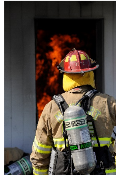
Newport Fire Department