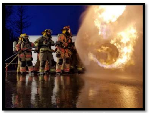
Fire Training Exercise