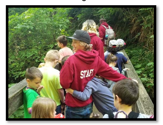
Parks and Recreation Hike