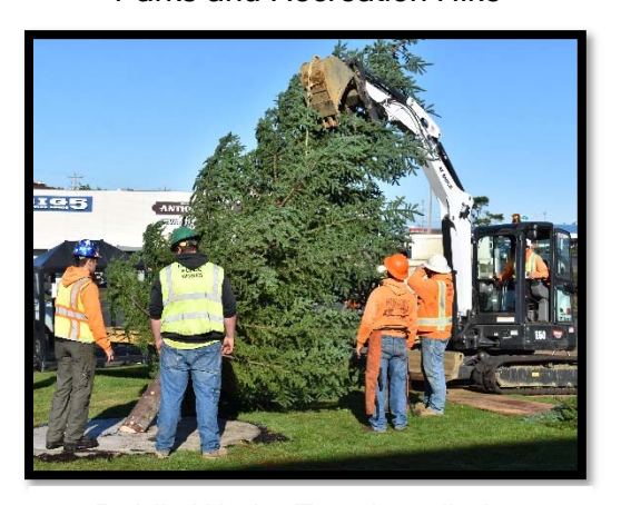
Public Works Tree Installation