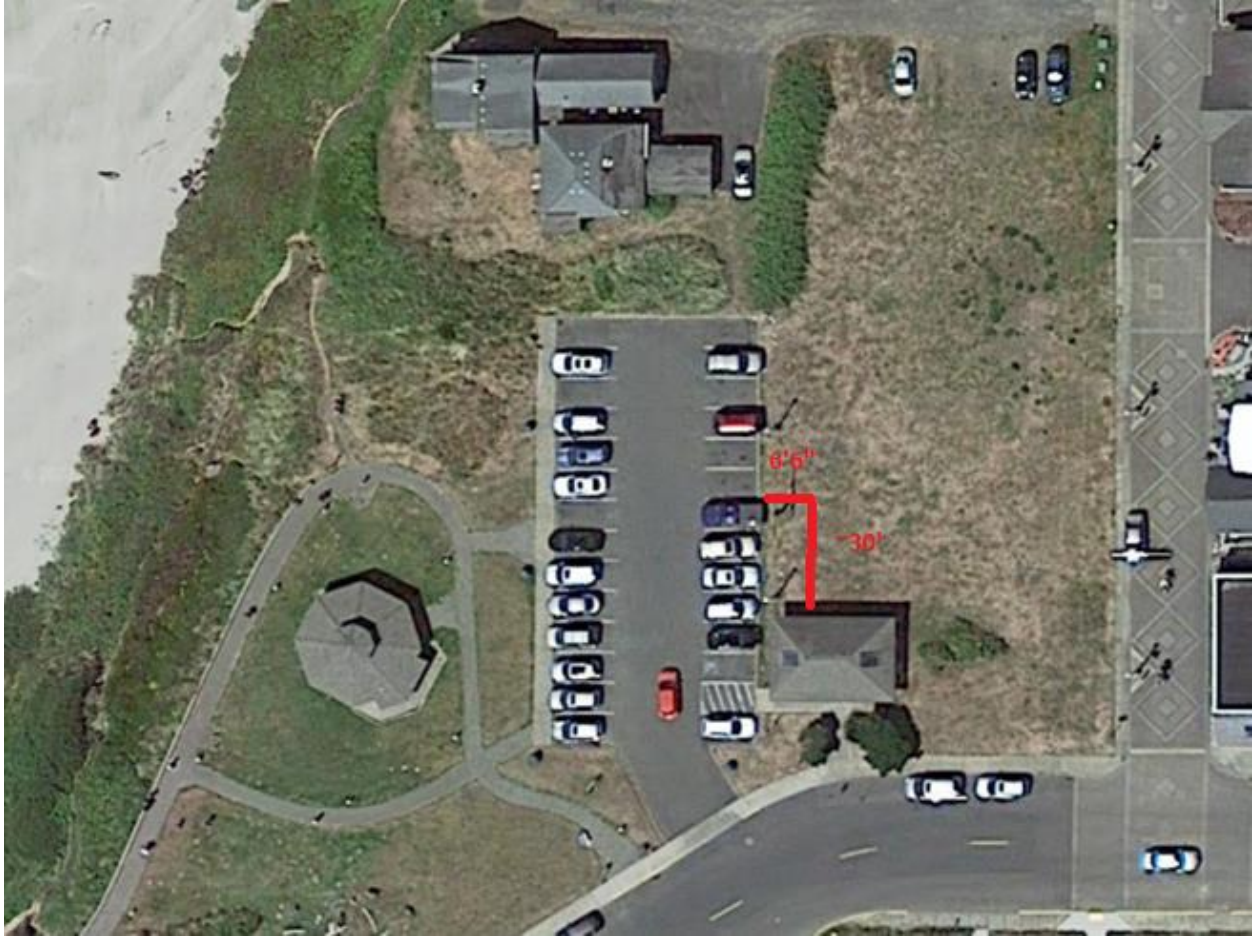
Approximately 30', and 6.6' from Curb.