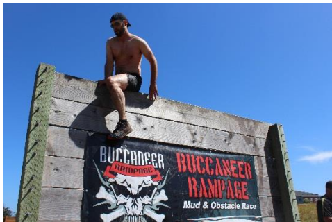
Buccaneer Rampage 2018