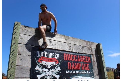
Buccaneer Rampage 2018