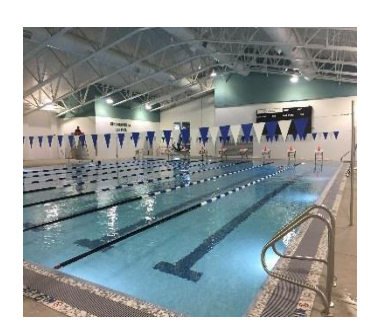
Swimming Pool-Aquatic Center

For the City of Newport and Newport Urban Renewal Agency