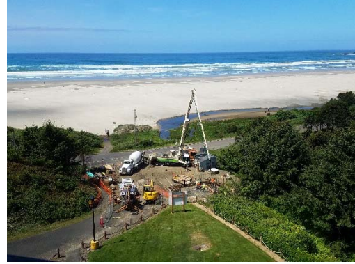
Construction Site – Agate Beach Pump Station