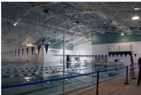
Newport Aquatic Center

Newport Urban Renewal Agency Annual Financial Report For Year Ended June 30, 2018 (A Component Unit of the City of Newport)