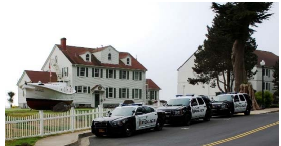
City Police Vehicles Displayed in front of US Coast Guard