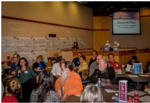
"Kick-Off – Vision 2040"